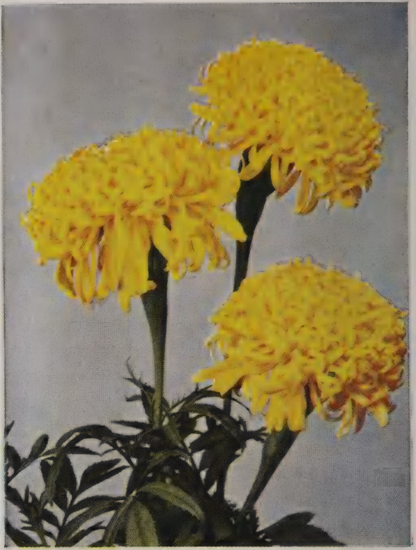
MARIGOLD, GOLDSMITH See description on page 22